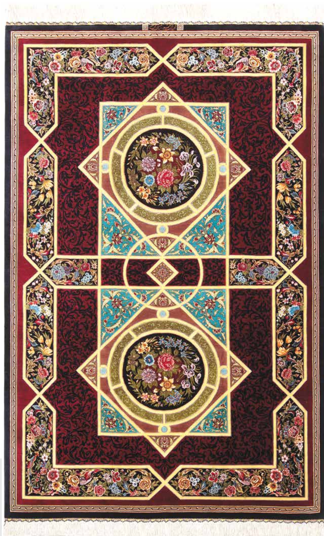
Rug Code: 1192 Creator: Hossein Erami Rug Design Name: Golfarang- Tazhib Material: Silk Size: 208x134 cm Year of Creation: 2013