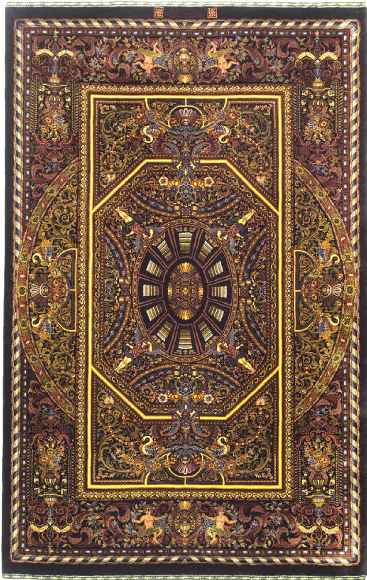
Rug Code: 1736 Creator: Hossein Erami Rug Design Name: Fereshteh Material: Silk Size: 106x162 cm Year of Creation: 2020