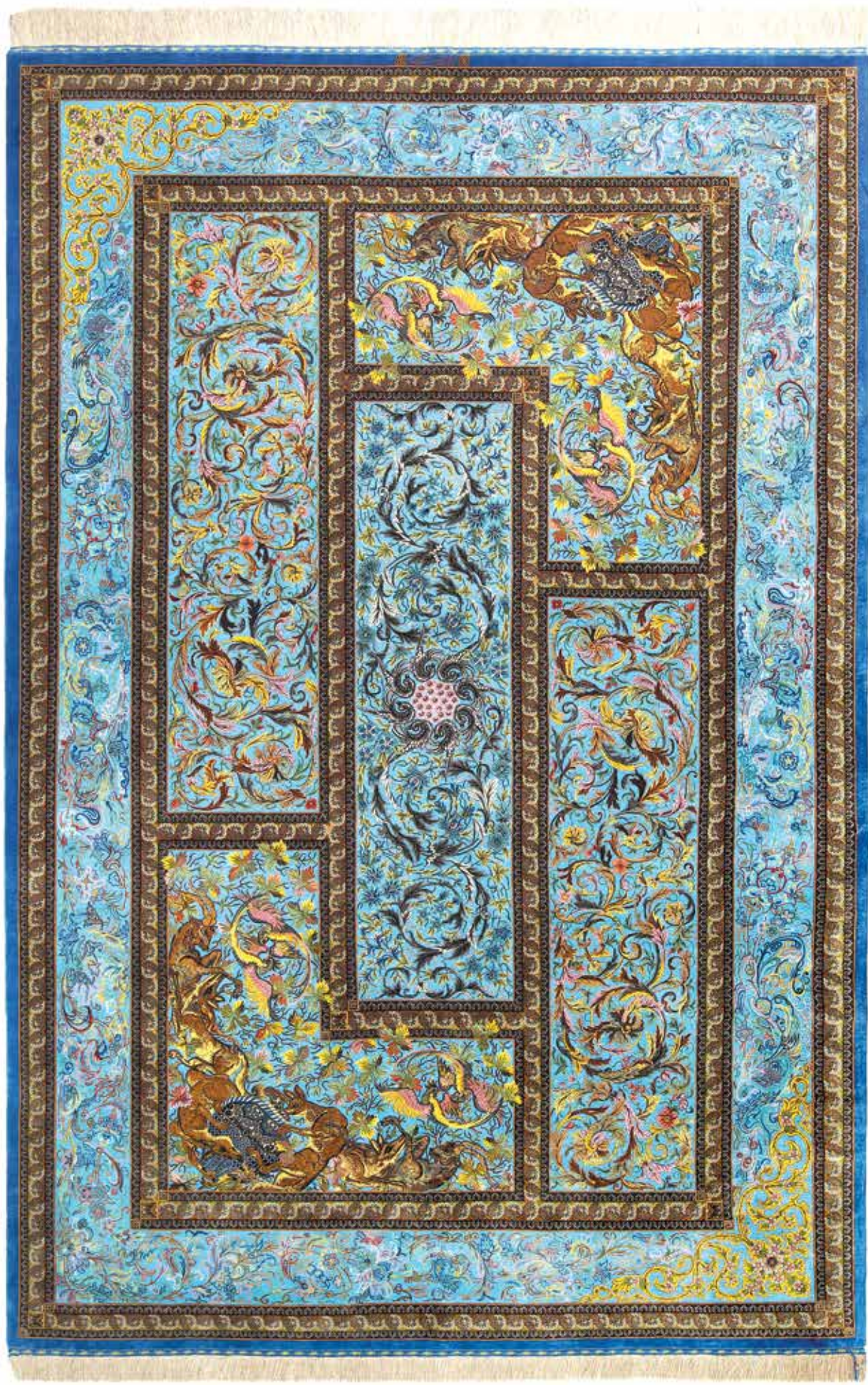
Rug Code: 1771 Creator: Hossein Erami Rug Design Name: Ghabi Golfarang – Master Farshchian Material: Silk Size: 200x301 cm Year of Creation: 2018