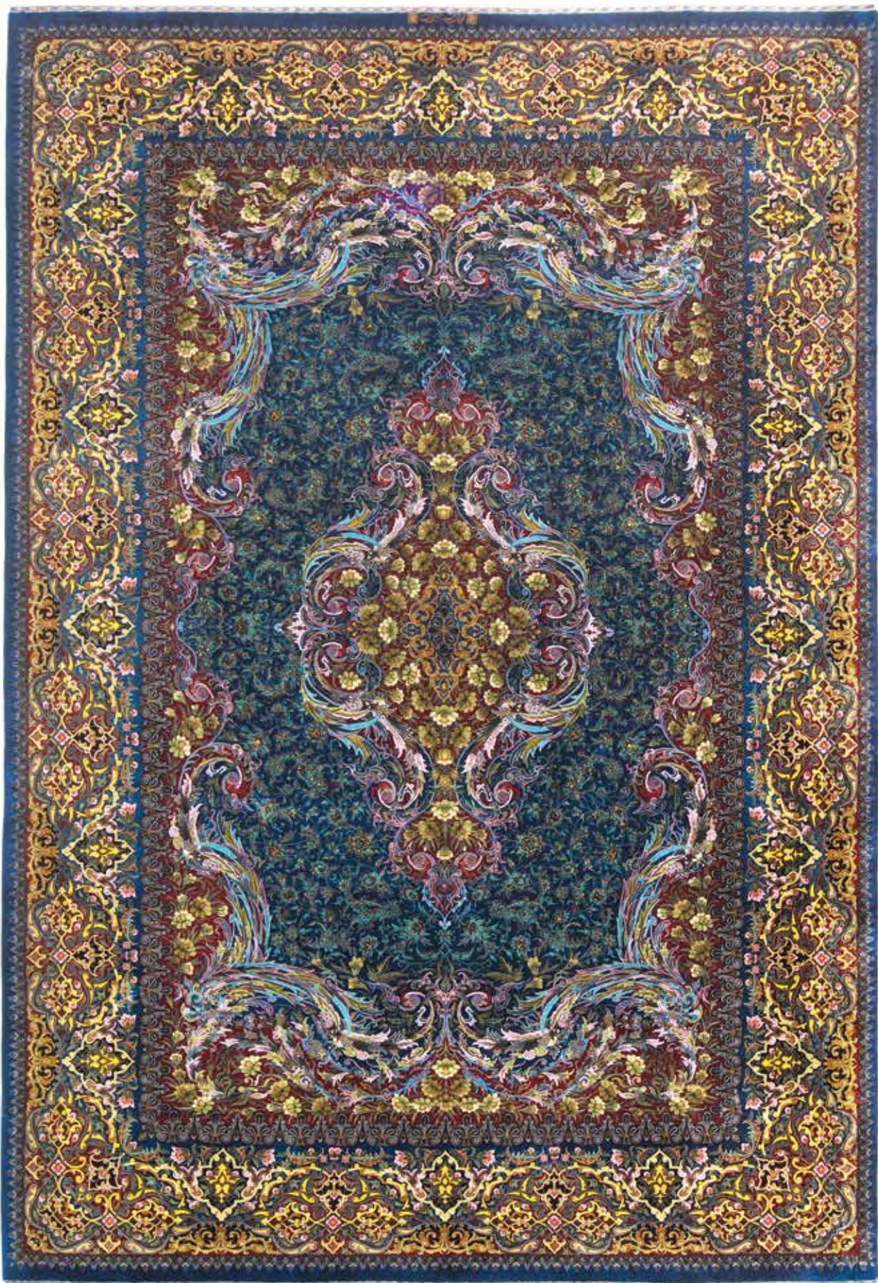
Rug Code: 1762 Creator: Hossein Erami Rug Design Name: Shah-Abbasi Material: Silk Size: 305x207 cm Year of Creation: 2020