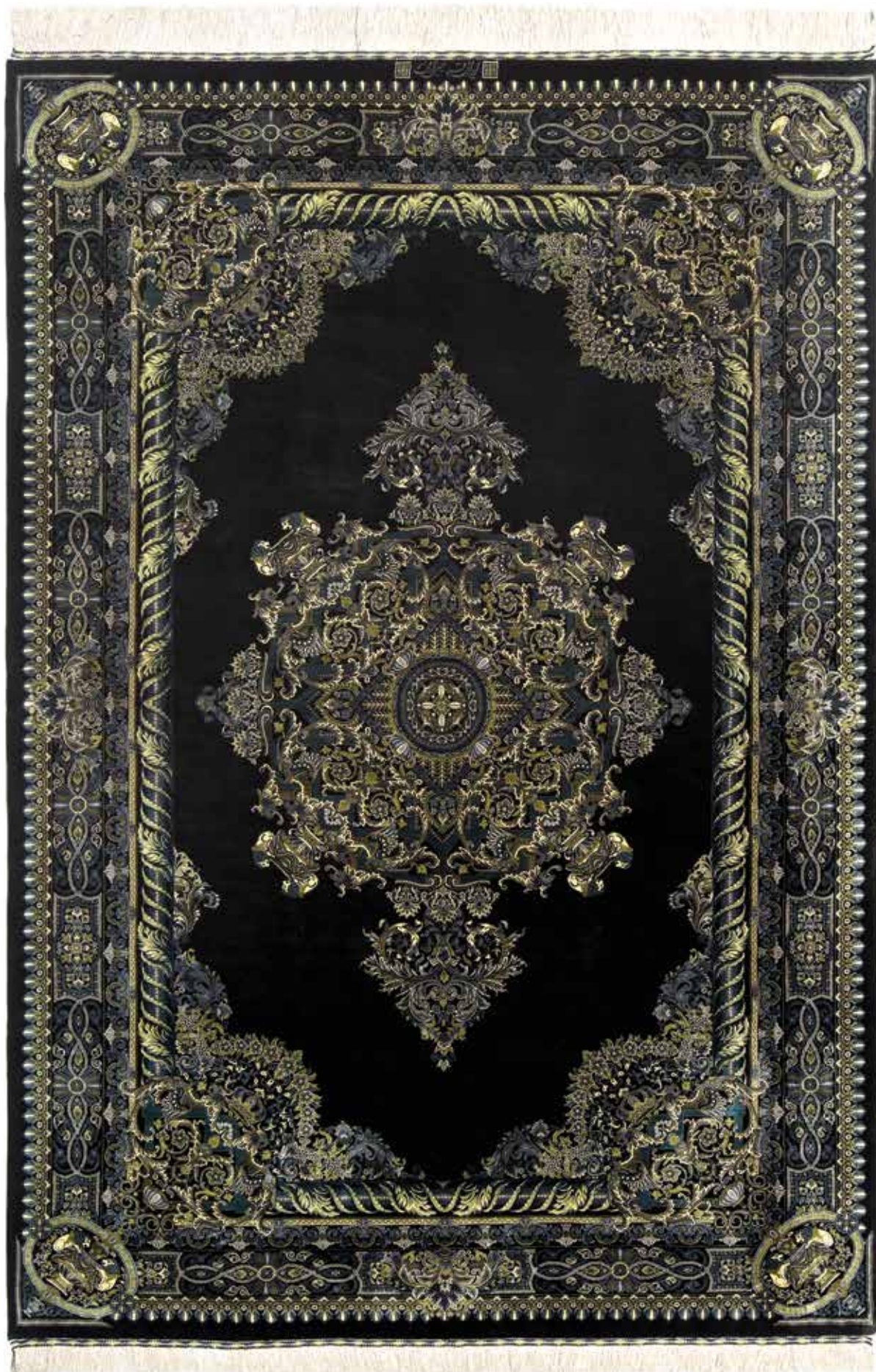
Rug Code: 1572 Creator: Hossein Erami Rug Design Name: Golfarang Material: Silk Size: 204x132 cm Year of Creation: 2017