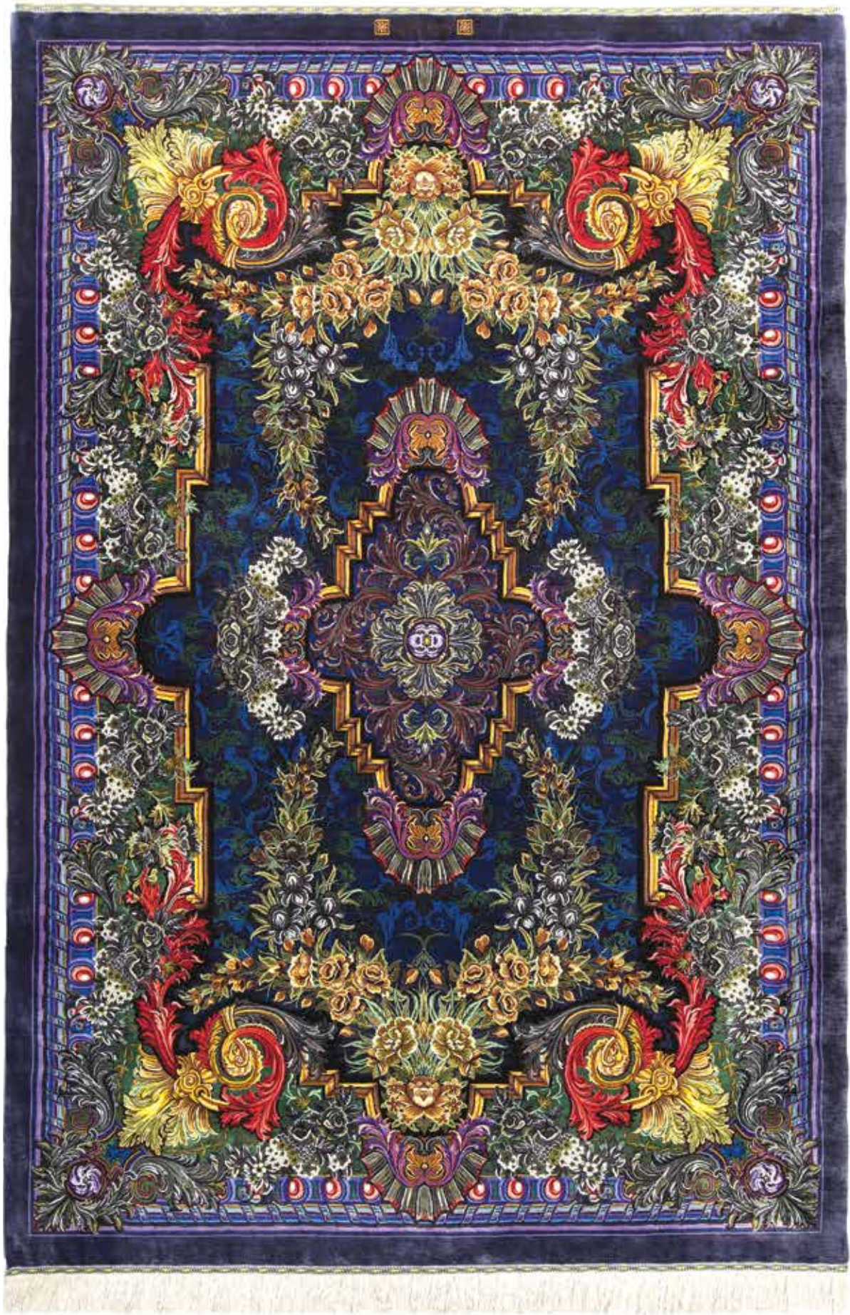
Rug Code: 1760 Creator: Hossein Erami Rug Design Name: Golfarang Material: Silk Size: 201x136 cm Year of Creation: 2021