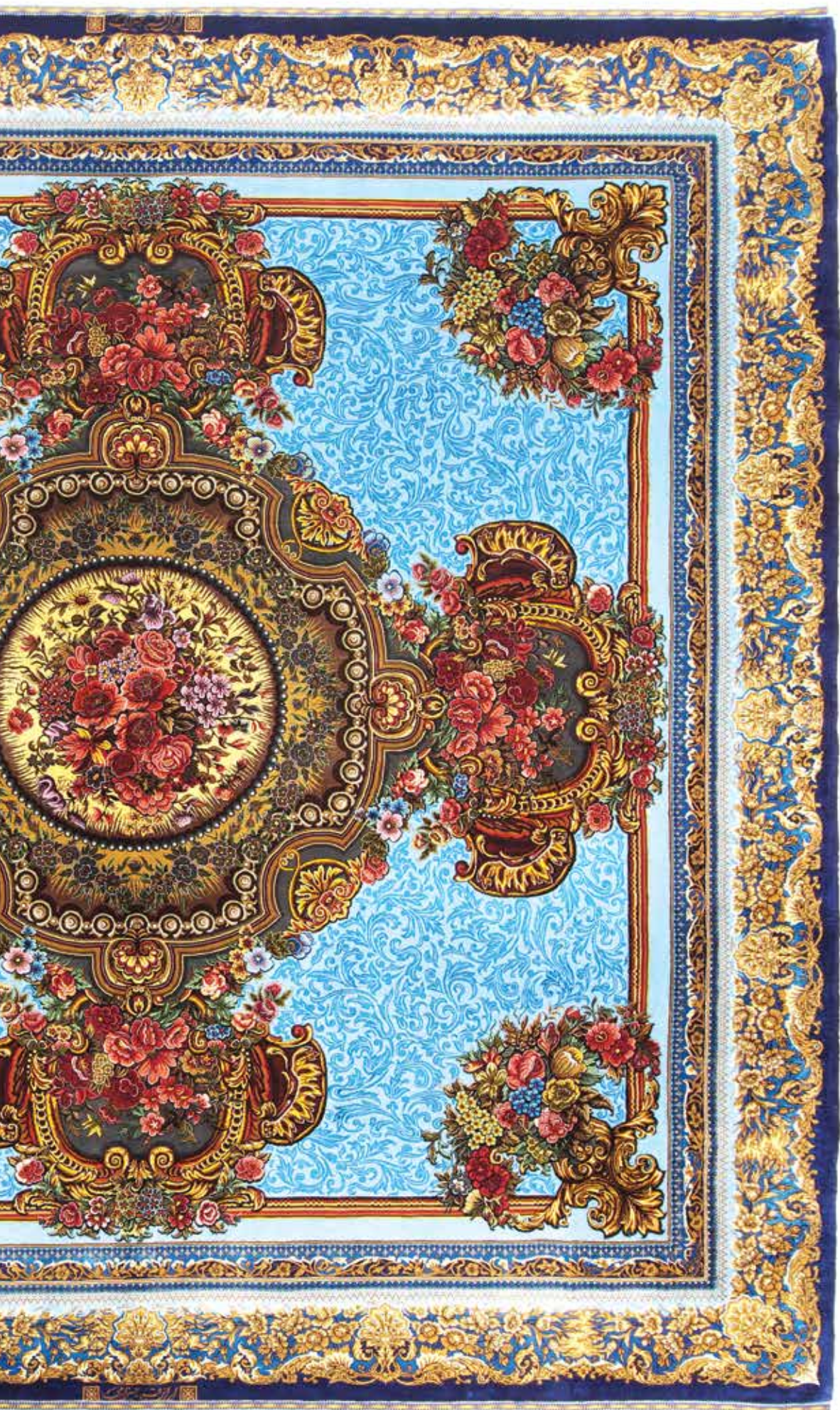
Rug Code: 1763 Creator: Hossein Erami Rug Design Name: Golfarang-Tak Gardeh Material: Silk Size: 202x212 cm Year of Creation: 2021