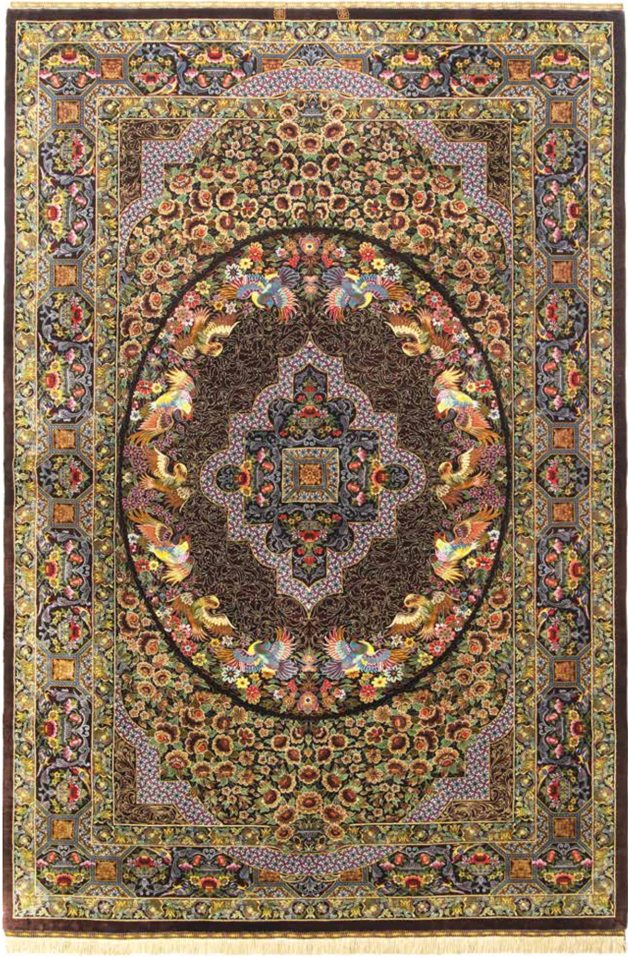
Rug Code: 1677 Creator: Hossein Erami Rug Design Name: birds Material: Silk Size: 196x132 cm Year of Creation: 2019