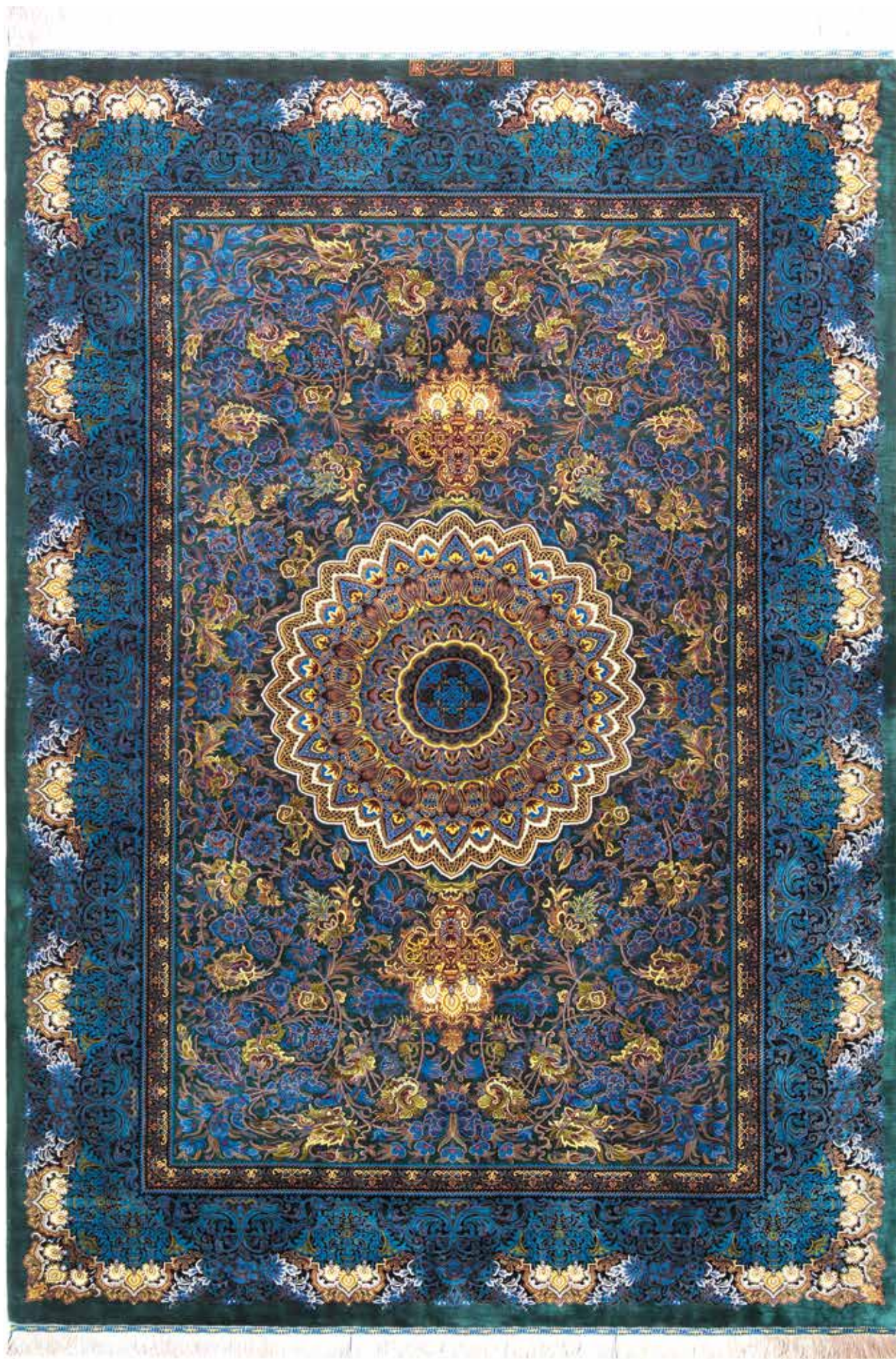
Rug Code: 1700 Creator: Hossein Erami Rug Design Name: Golfarang Material: Silk Size: 208x134 cm Year of Creation: 2020