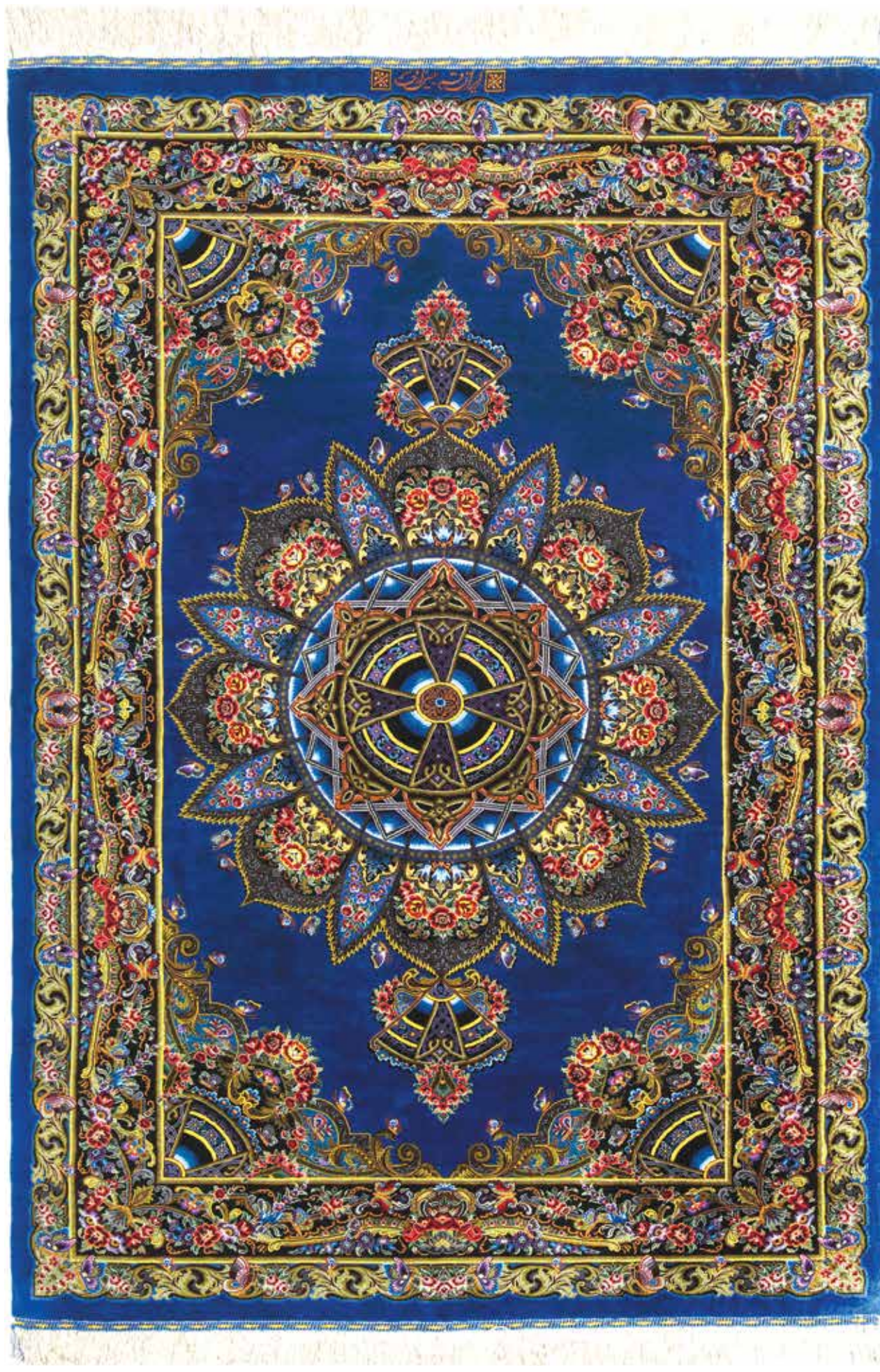
Rug Code: 1708 Creator: Hossein Erami Rug Design Name: Parvaneh Material: Silk Size: 102x157 cm Year of Creation: 2021