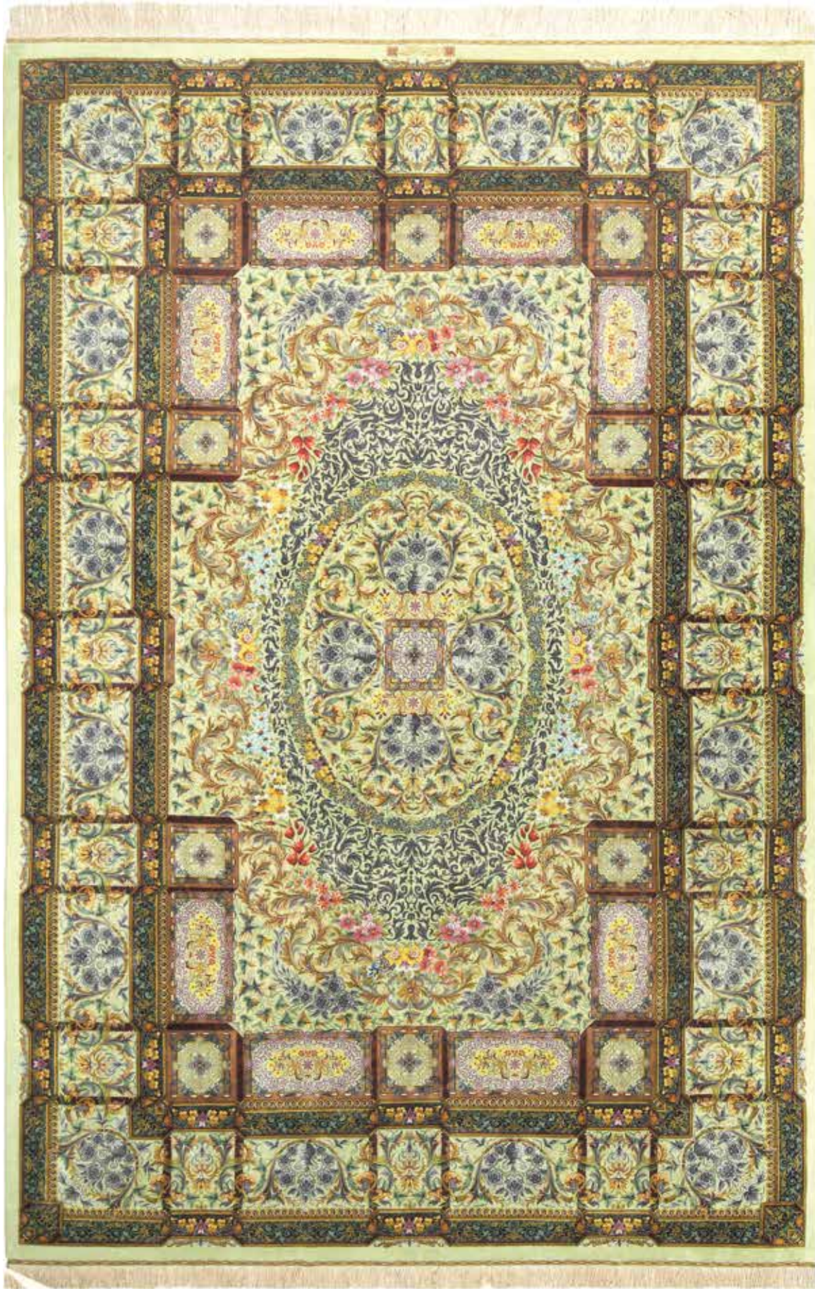
Rug Code: 1722 Creator: Hossein Erami Rug Design Name: Golfarang Material: Silk Size: 138x209 cm Year of Creation: 2021