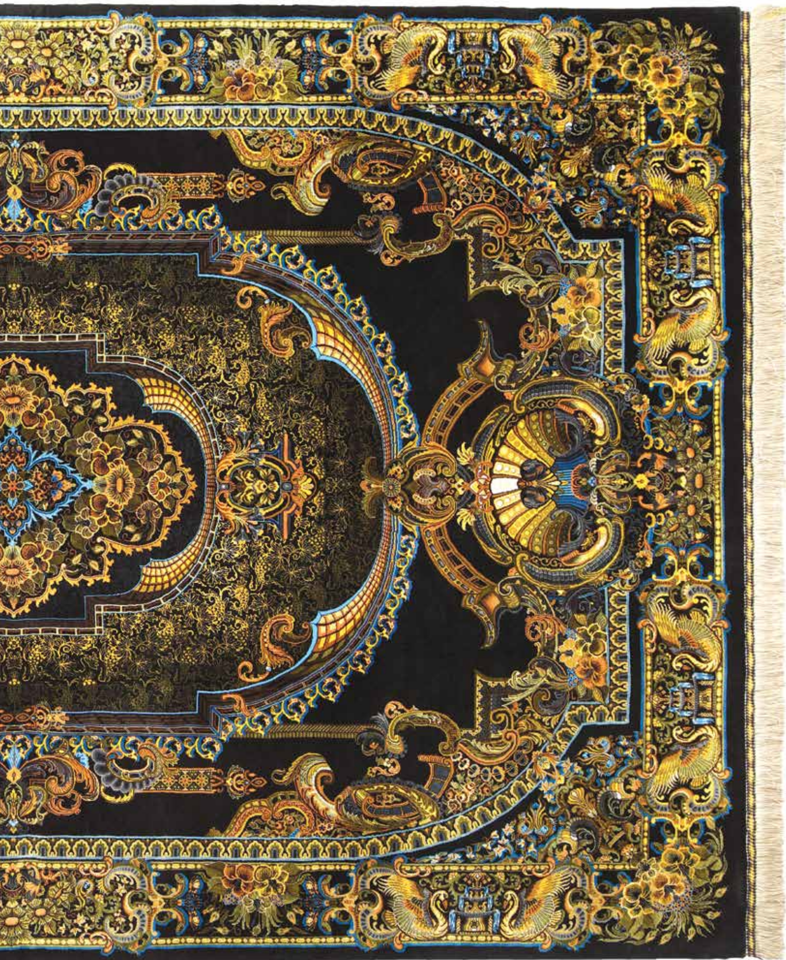
Rug Code: 1759 Creator: Hossein Erami Rug Design Name: Swan Material: Silk Size: 136x206 cm Year of Creation: 2021